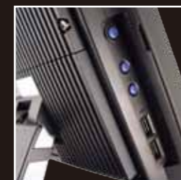
Push button LCD brightness adjustment and additional USB ports.