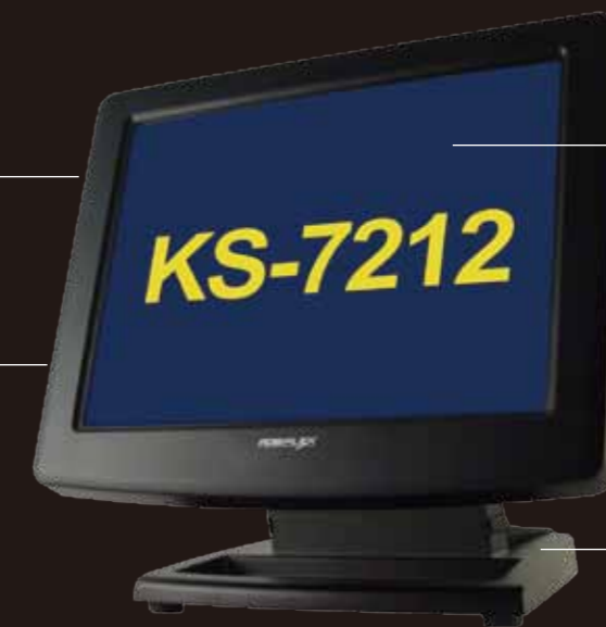
Resistive touch screen : 12" LCD